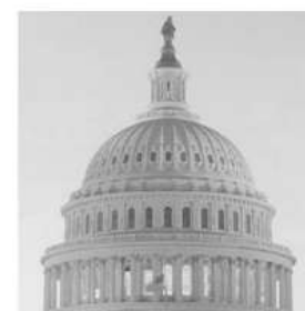
Figure 1.2: Examples of gray-scale images