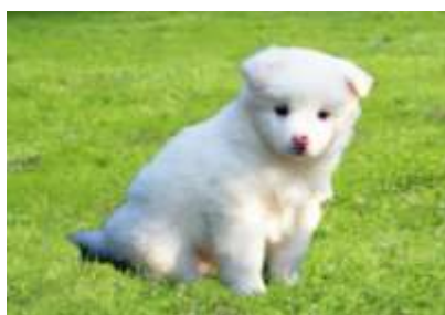
Fig1.5: Foreground image

Image acquisition is the initial stage of the vision system. First, data for input is selected from the test system, various image processing method can be applied to the image to perform the different vision tasks required today.