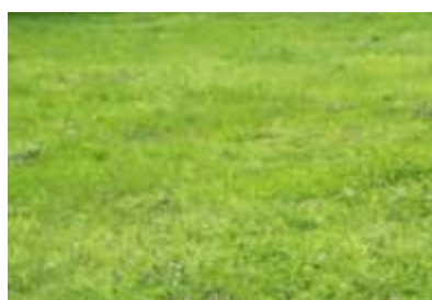
Figure1.6: Background Image