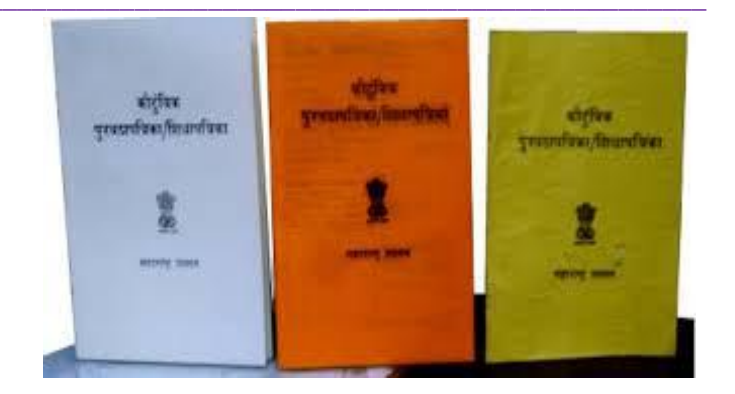
Fig.3.4. Ration Cards.