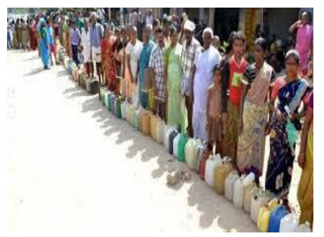
Fig.3.2. This is the condition of outside the ration shop.

In urban areas, Kerosene is supplied to ration card holders in the first week of every month and the ration shop keepers are taking keen steps to distribute Kerosene to cardholders a minimum of three or four days week.