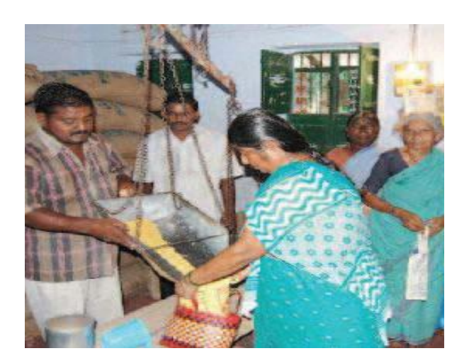
Fig.3.3. This is the condition inside the ration shop.