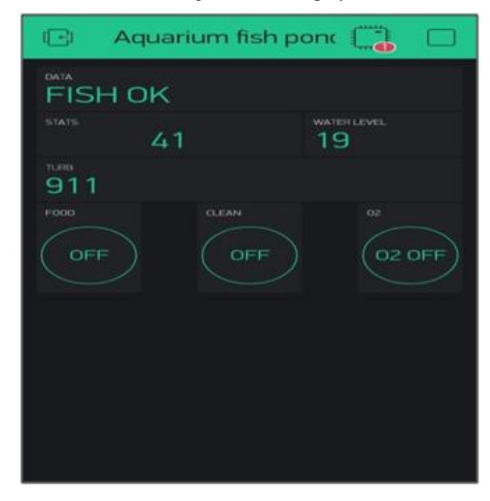
Figure: - Blynk software