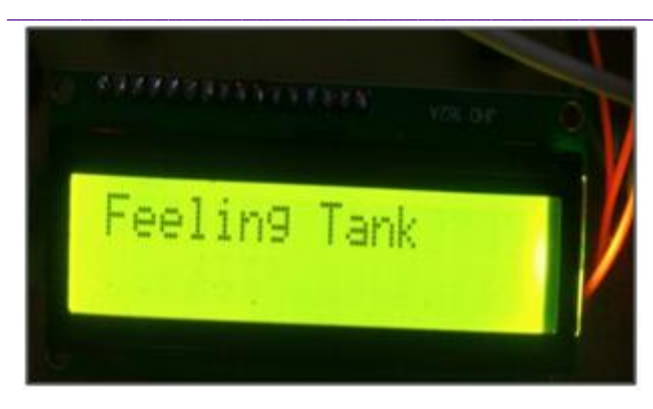
Figure:- LCD display