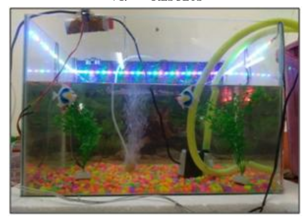
Figure:- Oxygenator of water