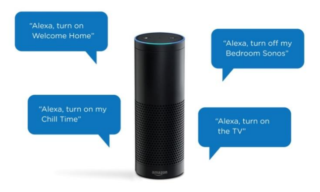
Fig. Alexa Echo

Alexa is an intelligent personal assistant which is based on cloud-based voice service developed by Amazon. It is very intelligent and capable of voice interaction, music playback, making daily notes, setting alarms, streaming podcast, playing audio books and providing weather, traffic, sport, and real time news updates. Alexa can control home automation system equipments using smart devices.