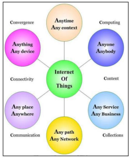
Fig. IOT Objectives

Technology in the world is getting integrated as internet spreads rapidly in this century. More than that internet of things has been bringing new sets of technological changes in our daily lives, which helps us to make our life simpler and more comfortable. IOT can be defined as- "An open and comprehensive network of intelligent objects that have the capacity to auto-organize, share information, data and resources, reacting and acting in face of situations and changes in the environment". [4] The IOT has different sets of objective mentioned below-