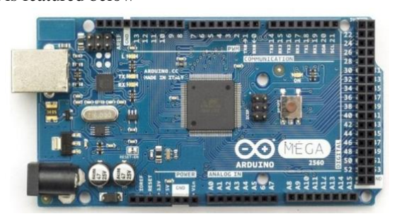
Fig. Arduino MEGA

Arduino is an electronics platform which is open source and based on simple hardware and software combination. Anyone who is interested in developing or creating new project or interactive objects or environments can simply program the Arduino and develop the same. It's like a super small computer system which can be programmed through PYTHON and can interact with different input output forms. There are multiple forms of Arduino according to the requirement of the project. The Arduino Mega is small as it can rest on human hand easily and operable with minimum 5V power supply. It has 54 input output pins and functions between 5v-20v. ATmega1280 microcontroller which is onboard has many features like 128 KB of flash memory, 4 KB boot loader, 8 KB SRAM, 4 KB EEPROM. The Arduino Mega is featured below-