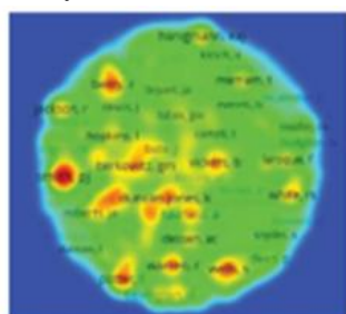
Fig.1 Literature Volume of Authors in Shakespeare Research 1900 – 2016

The paper sets up the significant parameters in VOSviewer programming to examine creator collaboration of the Shakespeare study writing from 1900 to 2016, with an aggregate of 11291 creators, of which 430 creators have in excess of 5 records what's more, more than 5 referred to times. Perception map (software consequently channel out "Unknown") is appeared in Fig. 1, the more profound the red, the more the archives, which gave that top five authors are SMITH, PJ, WELLS, S, BERRY, R, WARREN, R, DUNCAN-JONES, K, these analysts are progressively dynamic and have increasingly unmistakable commitment in the Shakespeare study.