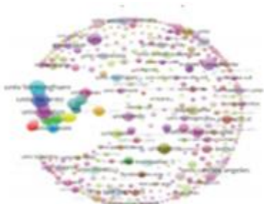
Fig. 3 Network Map of Organizations in Shakespeare Research 1900 – 2016

associations, as appeared in Fig. 3, in which every hub for an association, and hub's size shows the quantity of reports gave by the association. Association's impact can likewise be estimated by reports sum and referred to sum. This paper principally uncovers the persuasive associations in the field of Shakespeare's examination from two angles: distributed reports and normal references.