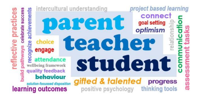
Figure 1: Parent-teacher student relation

The scope caters to responsibilities of the parents which are essential in the overall success of the child in school. They have to monitor the child going through several situations in school and things at home which make a child unhappy instead of hale and hearty. Younger ones commonly experience too many unpleasant emotions than positive ones. As far as possible the home and the school should create more and more situations in which pleasant experiences predominate. The look- after at home may offer certain suggestions to children to bring emotional imbalance. That is, health should be taken care of since children with poor health are irritable and with lack of confidence and optimism. Efforts should be made not to cause undue fatigue in children as tired children are difficult to handle. Suitable examples of emotional stability should be presented by elders since children tend to imitate the behavior of their elders. Proper training to face situation needs to be given to children since children show emotional outbursts when faced with a strange situation. The scope envisages only suitable being disciplinary mechanisms enforced home/school as more restrictions make children more revolting.