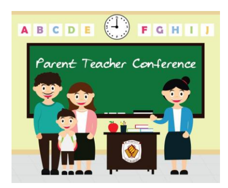
Figure 4: parents teachers conference

examples of achievers motivate the children to do well. On the other hand effective teacher's help students develop lively sharp minds, increased comprehensibility, awareness and practical talents, develop personal moral values and appreciate human endeavor and aspirations.