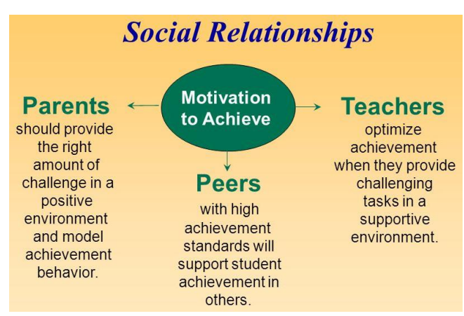
Figure 3: Social relationship of parents and teachers

School psychologist can help the school teachers overcome all these problems. Much that impacts kid's sentimental life precedes he goes to class. Yet, we should not expect that his frames of mind are totally impenetrable to any impacts. Past passionate experience can be adjusted to an extensive degree. Presumably, the most significant factor in a child's life is the adoration he gets from others, and the friendship he creates for other people. The adoration for guardians, the affection for an educator, the affection for friends all leave a blemish on everything that goes on consistently in his life. The youngster who is acknowledged will have a great deal of opportunity to give things a shot, to investigate, to commit errors and learn by that. He won't be dreadful. Where there is shared acknowledgment there is much space for unconstrained articulation. An educator in this way shuns showing evident partiality which offends of others.