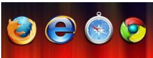
Figure 1. Most popular browsers

Different browsers provides different functionality and facilities for accessing websites. Rather than accessing websites the browsers are providing contents for various age groups. Such as for children you can enjoy games by adding games to your web browsers. Using youtube scripts you can download videos in your computer system. You can use browser for websites testing purpose for different platform websites. The websites which can have different views on different devices are known as responsive websites. The most popular browsers are shown in the figure below: