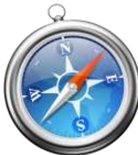
Figure 4. Safari Browser

Safari is web browser that was produced and developed by Apple Inc. which functions on a Mac OS X, iOS, and Windows operating system. It was first put out in public on January 7, 2003 by Apple Inc. It was Apple's default browser known as "Panther" for Mac users and released on June 11, 2007 on Microsoft Windows operating system. 4