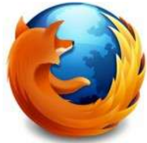
Figure 6: Firefox browser

Phoenix Technologies and had to be renamed because of trademark problems. It was renamed to Firebird which was a free database software project. There was conflict in using the name and the matter was resolved when they renamed the browser again to Firefox. Later on February 9, 2004, Mozilla Firebird became known as Mozilla Firefox then simply referred to as Firefox (Fx, or FF). 8