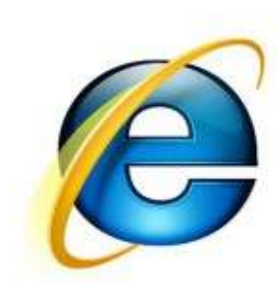
Figure 2. Internet Explorer

Internet Explorer is generally the first component of Windows used in 1995 that is generally known as Microsoft Internet Explorer (IE or MSIE) containing a series of graphical web browsers and works only on Windows Operating systems 1. Over the years, it has been updated to different versions to improve the operating system for Microsoft Windows.[1]