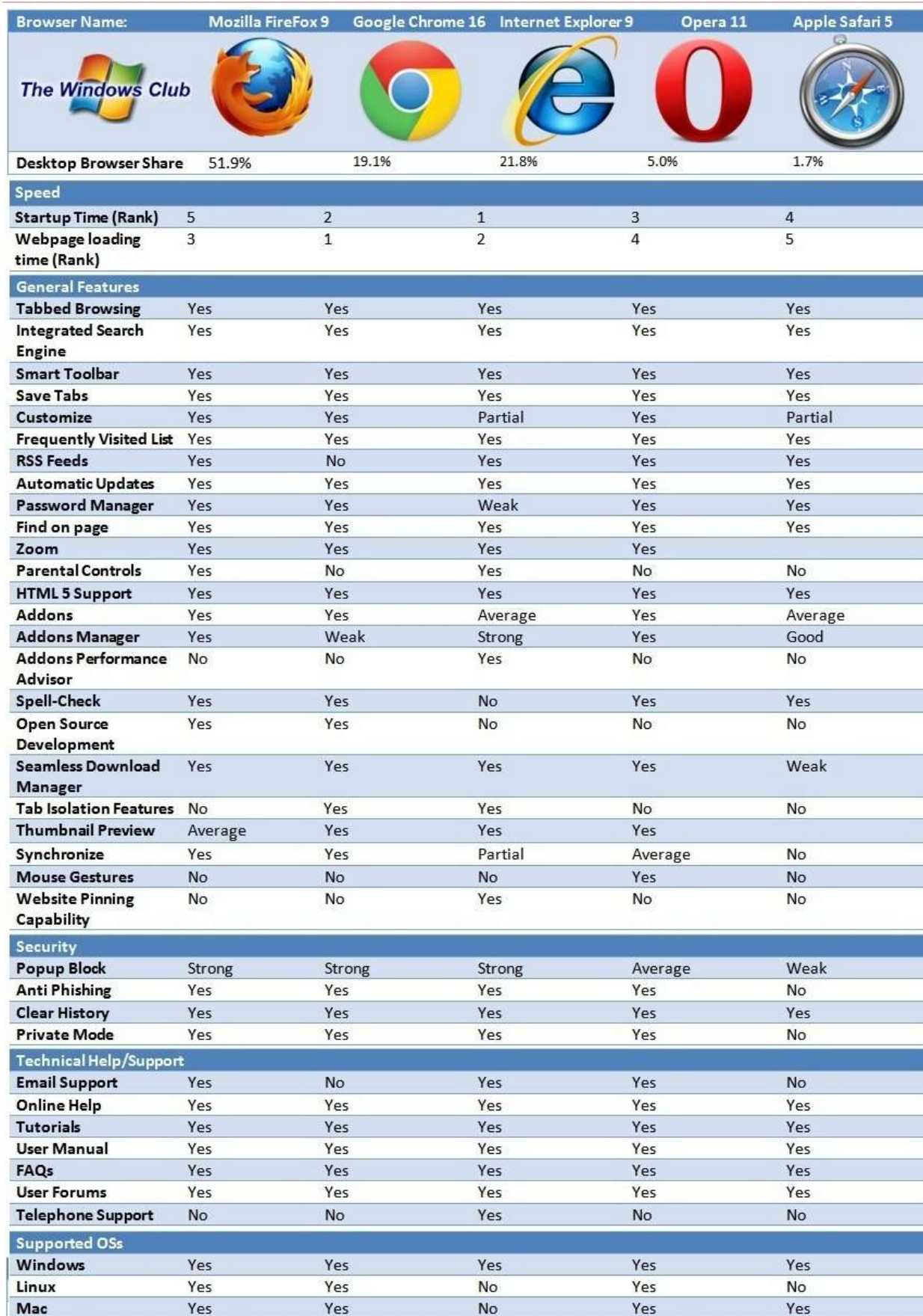
Figure: Comparison of browsers with features [14]