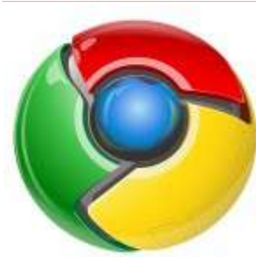
Figure 5: Chrome Browser

It was written in C++, Assembly, Python, and JavaScript. Now a days it is available in 50 languages. For more information you can check out website www.google.com/chrome . 5