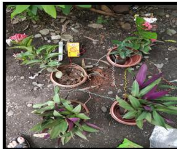
Fig.1. Experimental set up

The connection diagram is as shown in following figure.2. The electrode with higher and lower electrode potential was selected as Anode and cathode. Simultaneously oxidation and reduction process occurs at anode and cathode allows the flow of negative ions to the anode and positive ions move towards cathode.